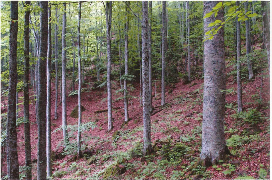
Fig. 3: Oriental beech forest ( Fagus orientalis ) in the Yedigöller National Park (Northwest Turkey). Photo: U. Hauke, June 2005.

Abb. 3: Orientbuchenwald ( Fagus orientalis ) im Nationalpark Yedigöller (Nordwest-Türkei). Foto: U. Hauke, Juni 2005.