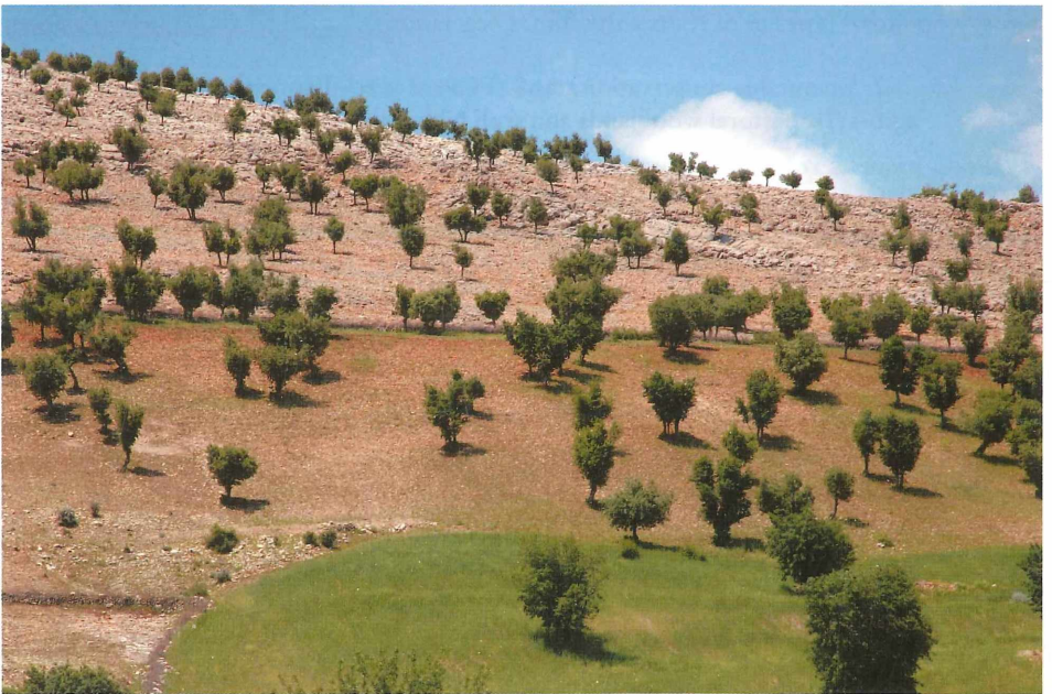
Fig. 6: Agrosylvopastoral deciduous oak woodland in the Nemrud National Park, province of Adiyaman, eastcentral Turkey. Photo: U. Hauke, June 2005.