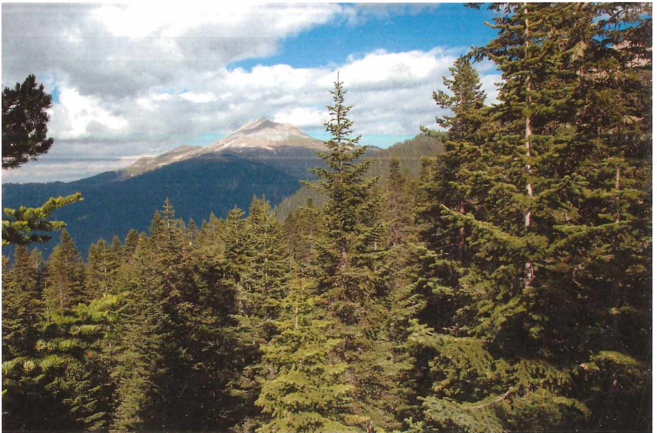
Fig. 4: Abies bornmuelleriana forest near timberline at 1700 m in the Ilgaz mountain range (province of Kastamonu, northern Turkey). Photo: U. Hauke, June 2005.

Abb. 3: Orientbuchenwald ( Fagus orientalis ) im Nationalpark Yedigöller (Nordwest-Türkei). Foto: U. Hauke, Juni 2005.