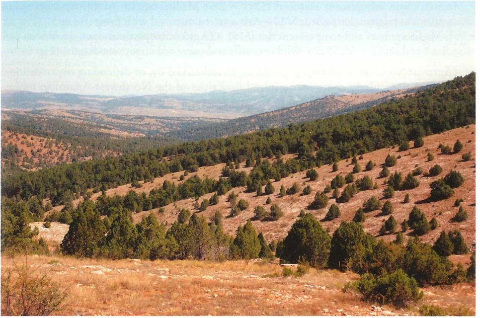
Fig. 5: Juniperus excelsa pasture woodlands in Central Anatolia, province of Sivas. Photo: U. Hauke, August 2005.