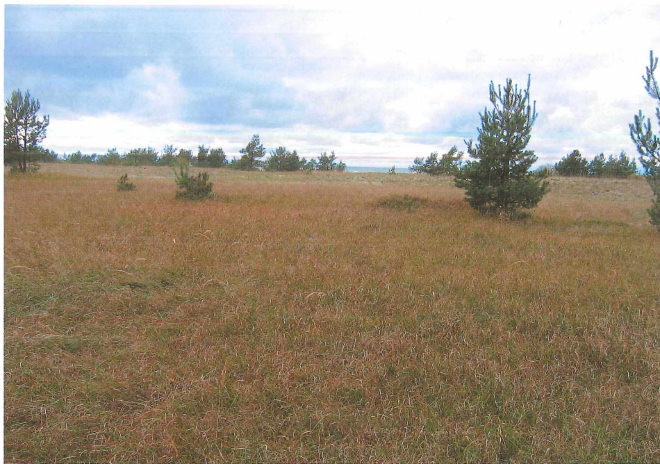
Fig. 4: Caricetum arenariae in Pāvilosta.

Stands of the Caricetum arenariae with dense vegetation mostly occur in depressions and on leeward slopes. These sites are relatively humid, eutrophic and protected by dunes from sea wind and sand drift. Often, Caricetum arenariae is like a contact community between mesophytic grasslands and the Festucetum polesicae or even primary dunes with Leymus arenarius . The main localities of the older successional stages Caricetum arenariae are the widest dune areas of, e.g., Nida-Pape, Ziemupe, Pāvilosta and Rīga. These dunes were formerly grazed or cut, but during the last 20 years this land use has nearly stopped.