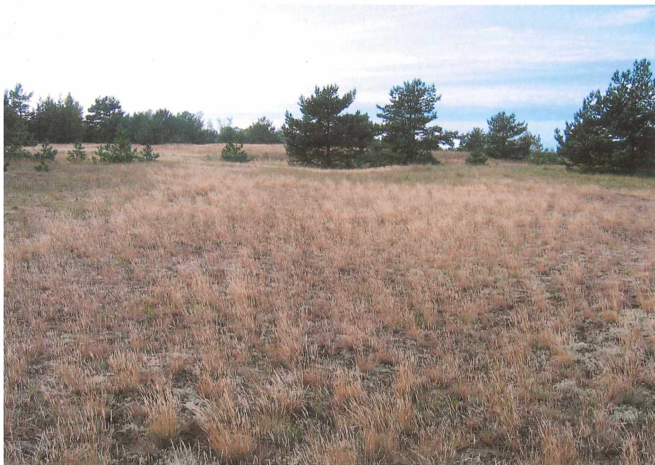
Fig. 3: Corniculario aculeatae-Corynephorum canescens in Pāvilosta.

burned, creating mobile sand areas without vegetation. However, the former land use has drastically decreased during the last 20–30 years. Many grey dunes have been overgrown with pine trees, shrubs or dense Calamagrostis epigeios stands, and only some sandy patches or belts on pathways develop periodically. As wind is a significant factor even for grey dunes, and considering that the dunes of Pāvilosta are situated towards the sea, the ecological preconditions are more or less favourable for the Corynephorus canescens habitat development. The Corniculario-Corynephorum typically colonises weakly acid to neutral soil without a humus layer or with a very thin one. A limiting factor for plants is the shingle-sandy soil substrate, which is easily leached.