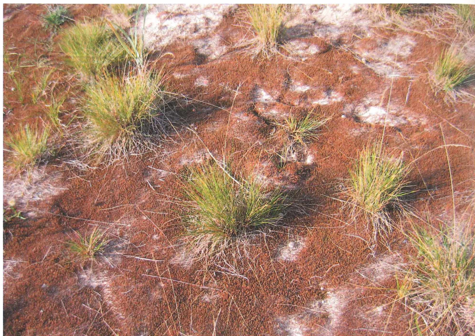
Fig. 5: Festucetum polesicae , variant of Gypsophila paniculata , in Pape.