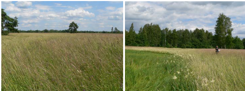
Fig. 4. Characteristic landscape of the homogeneous site with a flat and wide floodplain. The right photo shows the location of transect no. 8. Wet grassland with a stand of pure Carex acuta on the left, transitional grassland with Alopecurus pratensis and Filipendula ulmaria in the middle and dry grassland with Helictotrichon pratense on the right.

Abb. 3. Charakteristische Landschaft des heterogenen Gebiets mit trockenem Grasland auf den Dämmen und Feuchtgrasland in den Senken. Das linke Foto wurde im Bereich von Transekt Nr. 4. aufgenommen. Das rechte Foto zeigt die Lokalität von Transekt Nr. 2 (der rechts neben der Senke liegt). In der Senke wächst Carex vulpina . Die Grenze zwischen dem Übergangsbereich und trockenem Grasland ist durch Beweidung verwischt.