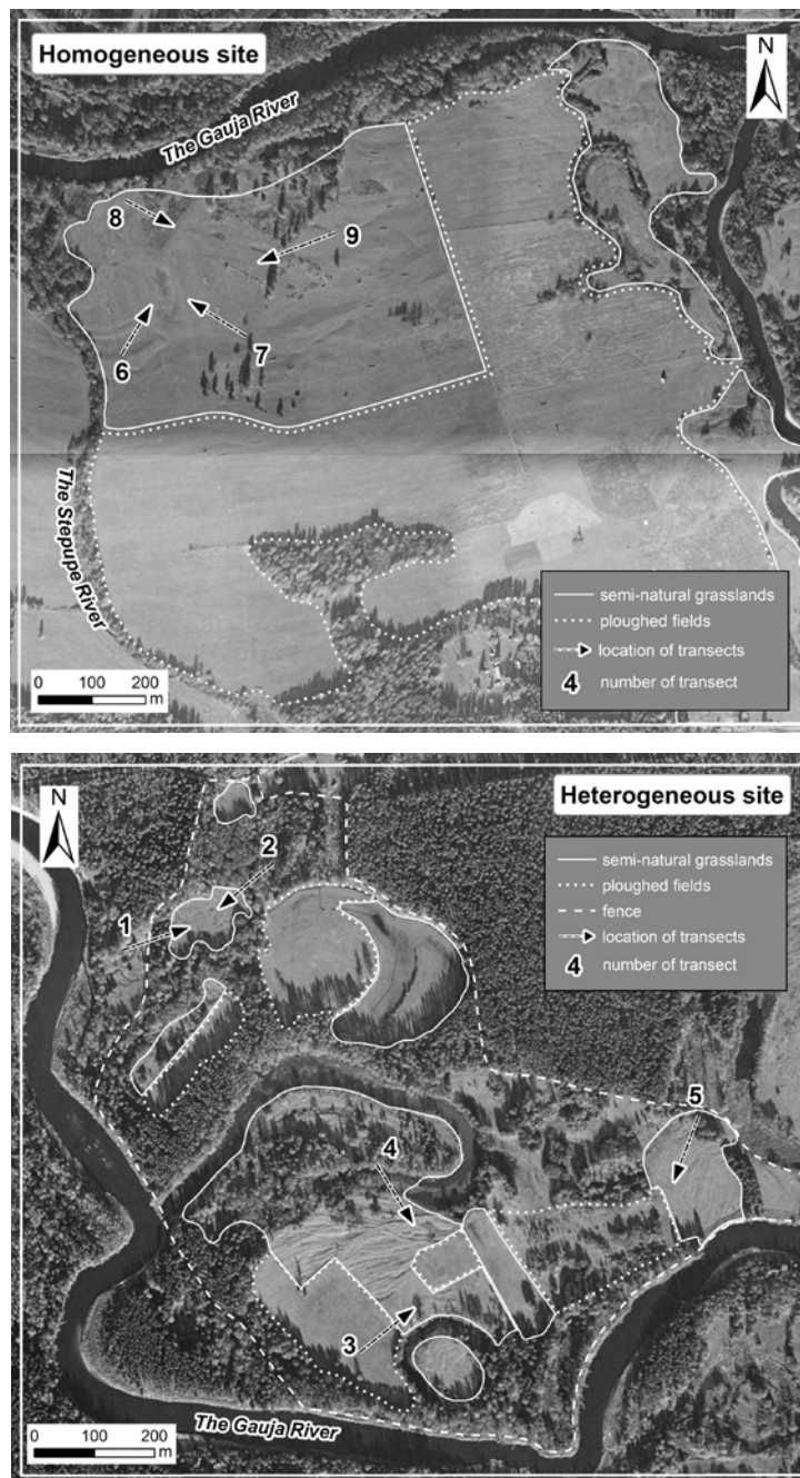
Fig. 2. Location of transects and land-use of study sites between 1950 and 1990. Note the very articulated microrelief creating high habitat density in the heterogeneous site (best visible in the area of transect no. 4).

Abb. 2. Lage der Transekte sowie Landnutzung der Untersuchungsflächen von 1950 bis 1990. Beachte das stark ausgeprägte Mikrorelief in dem heterogenen Gebiet (untere Abb.) mit hoher Dichte an verschiedenen Habitaten (besonders gut sichtbar im Bereich von Transekt Nr. 4).