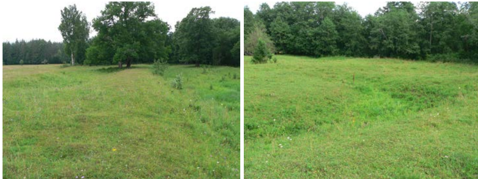
Fig. 3. Characteristic landscape of the heterogeneous site with dry grassland vegetation on levees and wet grasslands in depressions. The left photo is taken in the area where transect no.4. is located. The right photo shows the location of transect no. 2, which was located on the right side of the depression. Wet grassland with Carex vulpina was found in the depression. Differences of transitional grassland and dry grassland are smoothed out by grazing.

Abb. 3. Charakteristische Landschaft des heterogenen Gebiets mit trockenem Grasland auf den Dämmen und Feuchtgrasland in den Senken. Das linke Foto wurde im Bereich von Transekt Nr. 4. aufgenommen. Das rechte Foto zeigt die Lokalität von Transekt Nr. 2 (der rechts neben der Senke liegt). In der Senke wächst Carex vulpina . Die Grenze zwischen dem Übergangsbereich und trockenem Grasland ist durch Beweidung verwischt.