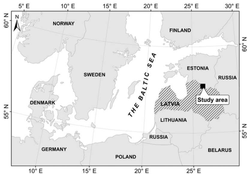
Fig. 1. Location of the study area.