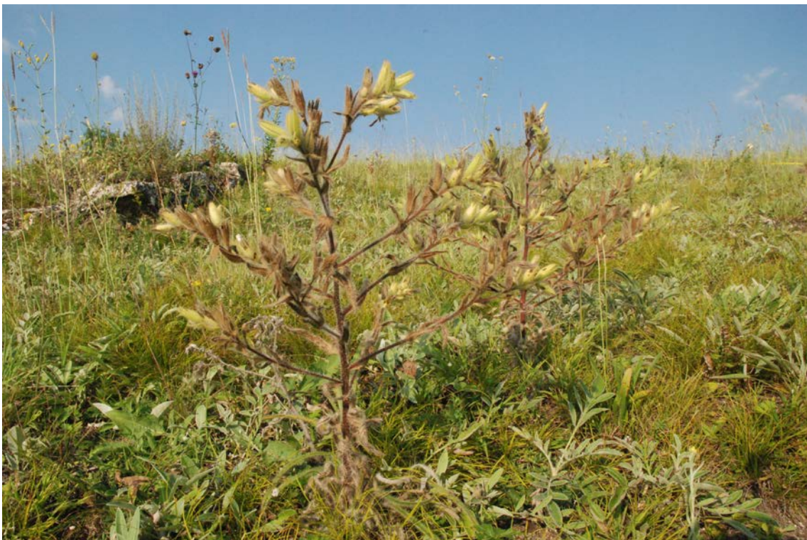
Salvia nutans-Carex humilis [ Stipion lessingianae ] community (2.2.3), Vilshanska river valley near Verkhnia Slobidka village (Site 14).