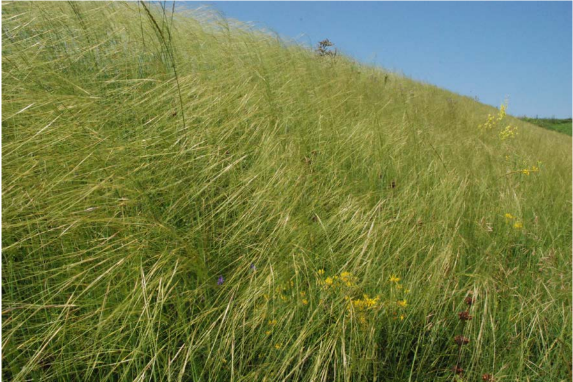
Teucrio pannonici-Stipetum capillatae (2.2.1), Kyrkiniak underground river valley near Bolgan village (Site 7).