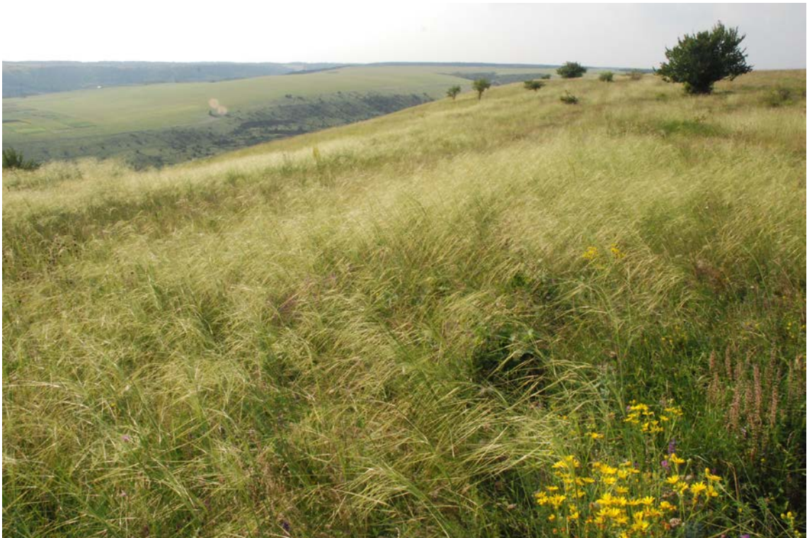
Teucrio pannonici-Stipetum capillatae (2.2.1), Vilshanka river valley near Verkhnia Slobidka village (Site 14).