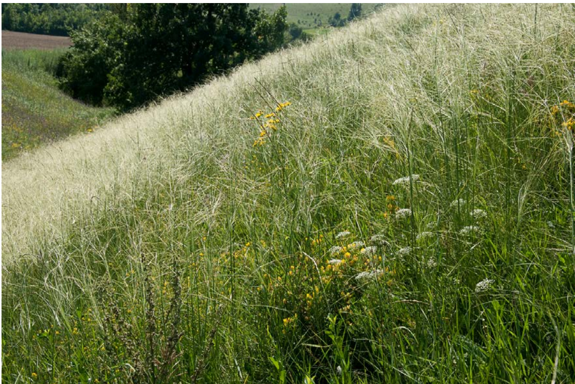
Teucrio pannonici-Stipetum capillatae (2.2.1), Carlina onopordifolia site “Romashkovo” (Site 6) (Photo: J. Dengler, 103737).