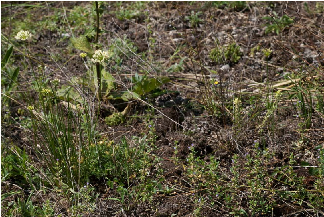
Ajuga chamaepitys subsp. chia - Sedum acre [ Alyssa alyssoidis - Sedion ?] community (1.1.1), Locality “Enchanted valley” near Dmytrashkivka village (Site 9) (Photo: J. Dengler, JD104047).