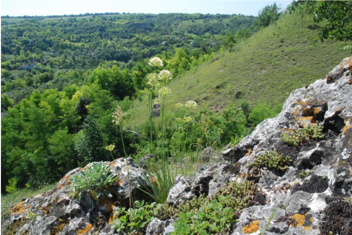
Ajuga chamaepitys subsp. chia - Sedum acre [ Alyssa alyssoidis - Sedion ?] community (1.1.1), “Enchanted valley” near Dmytrashkivka (Site 9).

Anhang S3. Fotoauswahl der Trockenrasentypen Zentral-Podoliens.