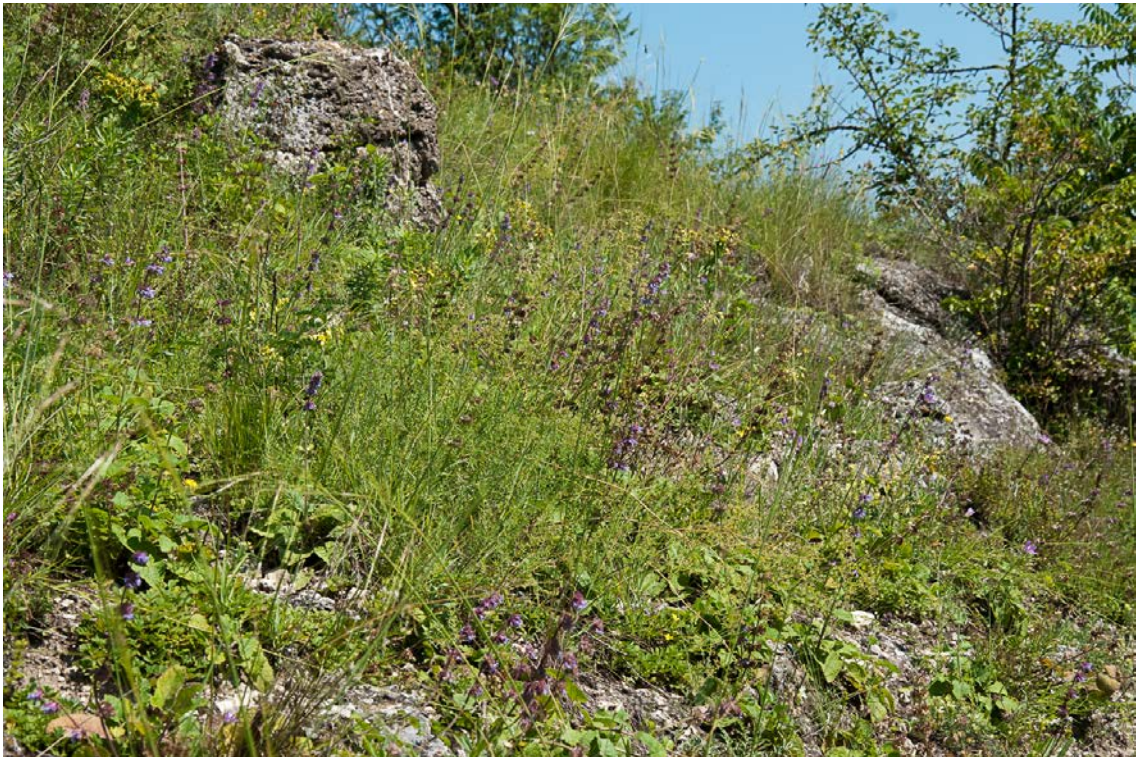
Allio taurici-Dichanthietum ischaemi (2.2.2), Kamianka river valley between villages Bolgan and Kukuly (Site 8) (Photo: J. Dengler, JD103915).