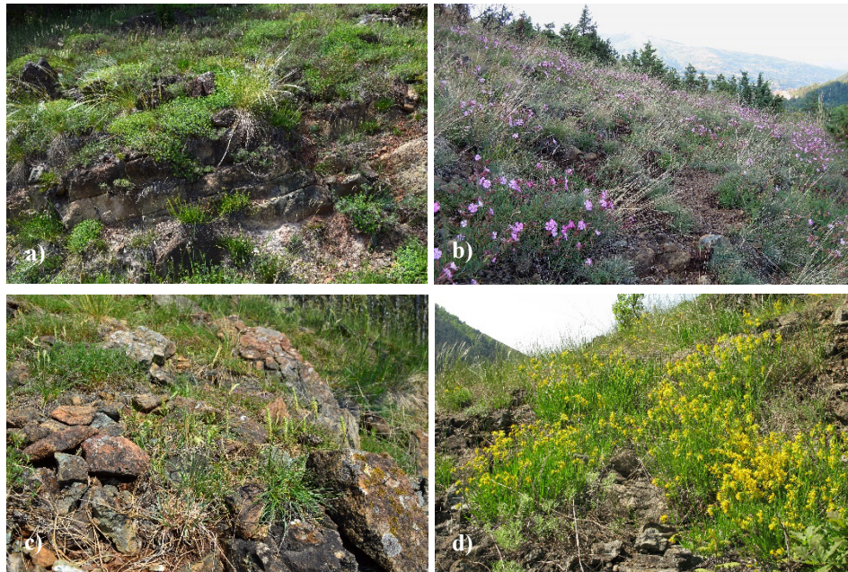
Fig. 2. Steppe-like vegetation on shallow ultramafic soils in the Balkans included in the order Halacsyetalia sendtneri. a) Stand of a Festuco ovinae-Euphorbietum glabriflorae ( Potentillion visianii) in the Mt Zlatibor Mountain, Serbia. Visible are Artemisia alba, Euphorbia glabriflora, Halacsya sendtneri and Stipa gr. pulcherrima. b) Stand of a Cynancho vincetoxici-Saponarietum intermediae ( Centaureo kosaninii-Bromion fibrosi) in the Mt Šarplanina Mountain, Brezovica, Gradište, Kosovo. Visible are Festuca gr. valesiaca and Saponaria sicula subsp. intermedia. c) Stand of a Poo alpinae-Plantaginetum holostei (“ Thymion jankae ”) in the Mt Tara Mountain, Kremna, Serbia. Visible are Plantago holosteuum, Poa badensis gr. and Thymus jankae. d) Stand of a Stipetum novakii ( Potentillion visianii) in the Brđani-Schlucht, Serbia. Visible are Halacsya sendtneri, Stipa novakii und Artemisia alba sowie Gebüsche aus Quercus cerris und Fraxinus ornus.

Abb. 2. Steppenrasen der Ordnung Halacsyetalia sendtneri auf flachgründig-ultramafischen Böden auf dem Balkan. a) Bestand eines Festuco ovinae-Euphorbietum glabriflorae ( Potentillion visianii) am Mt Zlatibor, Serbien mit Artemisia alba, Euphorbia glabriflora, Halacsya sendtneri und Stipa gr. pulcherrima (Foto: N. Kuzmanović, 12.06.2015). b) Bestand eines Cynancho vincetoxici-Saponarietum intermediae ( Centaureo kosaninii-Bromion fibrosi) am Mt Šarplanina, Brezovica, Gradište, Kosovo, mit Festuca gr. valesiaca, Saponaria sicula subsp. intermedia (Foto: M. Lazarević, 11. 08.2014). c) Bestand eines Poo alpinae-Plantaginetum holostei (“ Thymion jankae ”) am Mt Tara, Kremna, Serbien, mit Plantago holosteuum, Poa badensis gr. und Thymus jankae (Foto: N. Kuzmanović, 10.06.2015). d) Bestand eines Stipetum novakii ( Potentillion visianii) in der Brđani-Schlucht in Serbien mit blühende Halacsya sendtneri (nach den österreichischen bzw. deutschen Botanikern Eugen von Halácsy und Otto Sendtner), Stipa novakii und Artemisia alba sowie Gebüsche aus Quercus cerris und Fraxinus ornus.