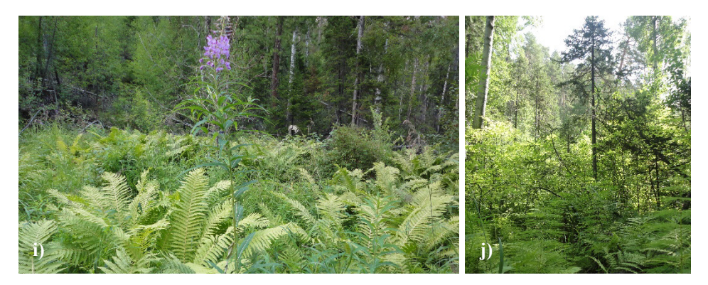
Fig. 2. Stands of the following forest communities: a ) and b ) Calamagrostio epigei-Pinetum sylvestris in the vicinity of Goryachinsk village, c ) and d ) Calamagrostio obtusatae-Abietetum sibiricae in the Katkovskaya mountain range, e ) and f ) Calamagrostio obtusatae-Laricetum sibiricae in the Katkovskaya mountain range, g ) and h ) Maianthemo bifolii-Pinetum sibiricae on the coast of Lake Baikal in the vicinity of Goryachinsk village, i ) and j ) Matteuccio struthiopteridis-Abietetum sibiricae in the Katkovskaya mountain range (Photos: E. Brianskaia, July 2015 except g) and h) August 2017).

Abb. 2. Bestände der folgenden Waldgesellschaften: a) und b) Calamagrostio epigei-Pinetum sylvestris in der Nähe des Dorfes Goryachinsk, c) und d) Calamagrostio obtusatae-Abietetum sibiricae im Katkovskaya-Höhenzug, e) und f) Calamagrostio obtusatae-Laricetum sibiricae m Katkovskaya-Höhenzug, g) und h) Maianthemo bifolii-Pinetum sibiricae an der Küste des Baikalsees in der Nähe des Dorfes Goryachinsk, i) und j) Matteuccio struthiopteridis-Abietetum sibiricae im Katkovskaya-Höhenzug (Juli 2015) (Fotos: E. Brianskaia, Juli 2015 außer g) und h) August 2017).